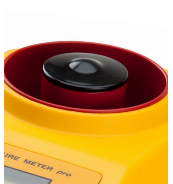
precise measurement chamber with temperature sensor