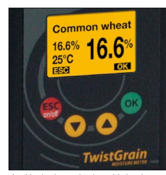
backlit display with adjustable brightness and backlight time