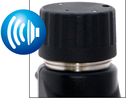
screw cap with buzzer