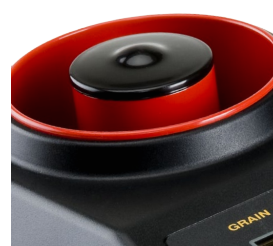
robust measurement chamber with temperature sensor