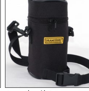
transport bag with strap