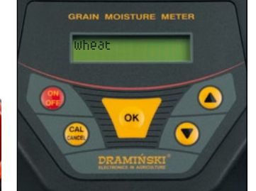
clear display with functional keyboard