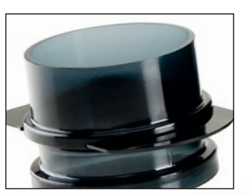
special dosage tube with slider