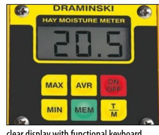
clear display with functional keyboard