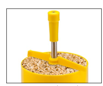
exact semi-automatic dosage tube