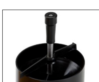
special semi-automatic dosage tube