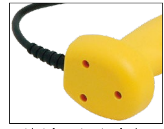
special grip for easy insertion of probe into heavily compressed material