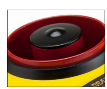
measurement chamber with temperature