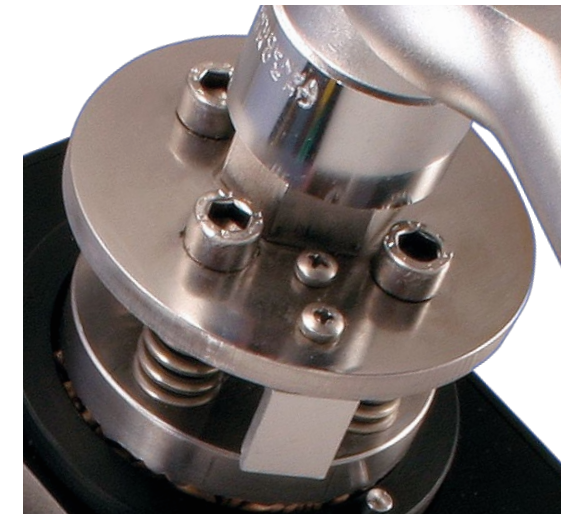
robust measurement chamber with temperature sensor and grinding discs made from galvanized hardened tool steel